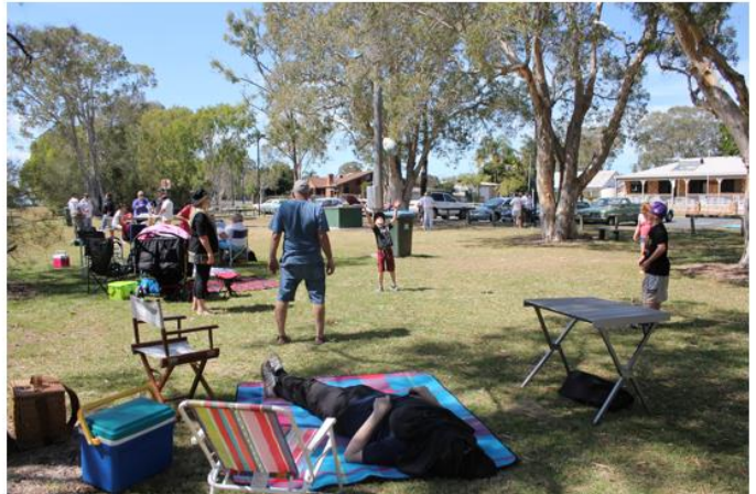
Fun in the park