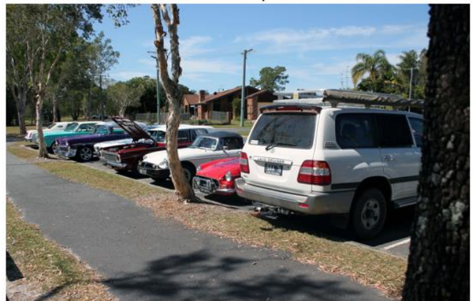
The cars (including a broken AP5 Valiant)