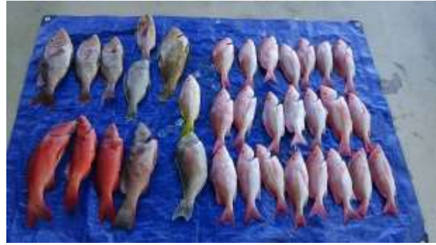
Can't get catches like this around here. Had to go to 1770.