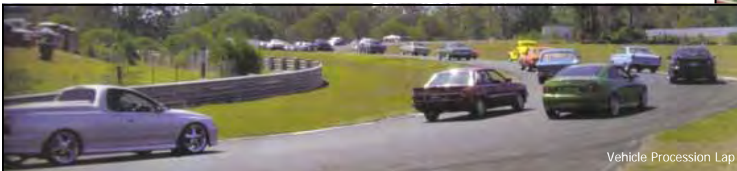
Vehicle Procession Lap