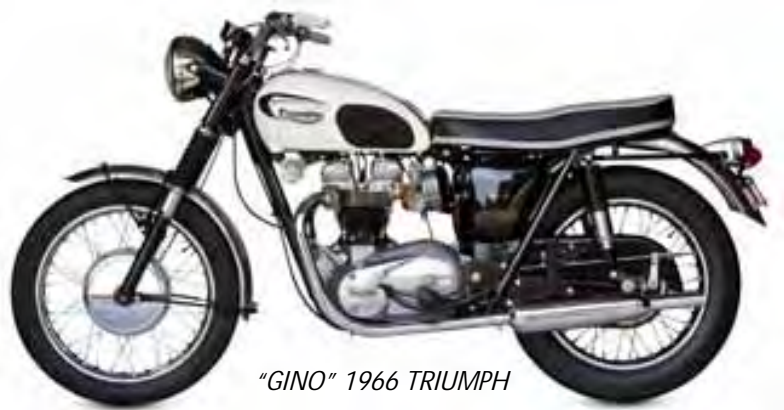
"GINO" 1966 TRIUMPH