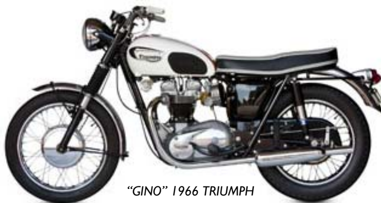
"GINO" 1966 TRIUMPH