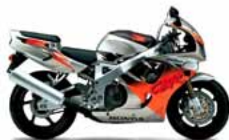
Example of a pure 'on road' design bike

If your bike falls into the category where it has some on road features but is predominately an off-road bike, the Administrator may grant Import Approval if you agree to the following: