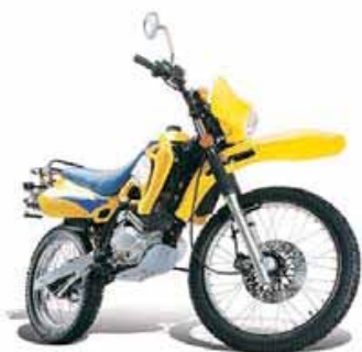
Example of a bike that has 'on road' features but could be also classed as 'off road' bike.