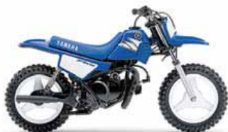
Example of an 'off road' bike

Generally if a bike was designed principally for 'on road use' and has lights, blinkers, side mirrors and provision for a number plate, it is regarded as an ON ROAD bike. However there are cases where some bikes are manufactured with the above features but are still regarded as an off road design. Below are examples of off/on road bikes: